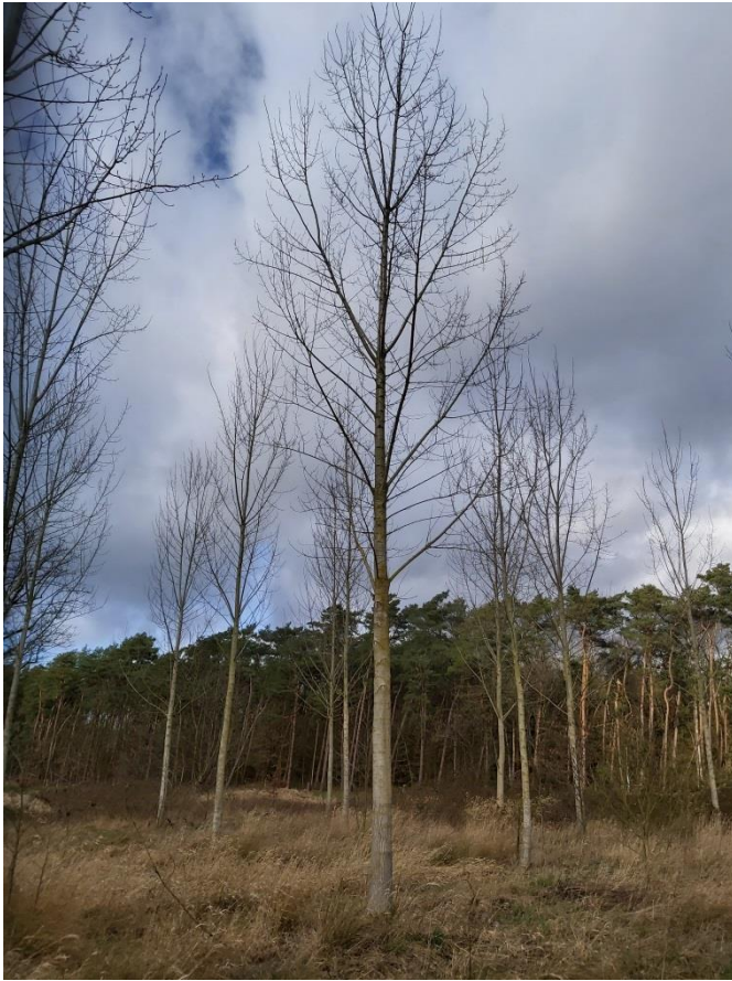
Dender, Zoutleeuw (Belgium)